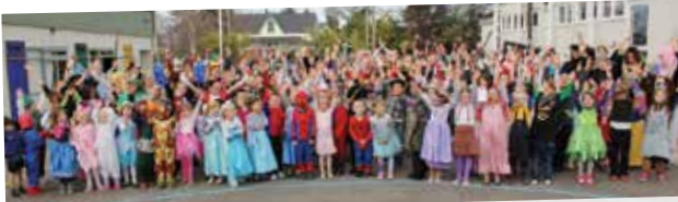
Waipukurau School students raised $317 to support the Rescue Helicopter with a fancy dress mufti day.

Well done to everyone at Waipukurau School, we hope you all feel very proud!