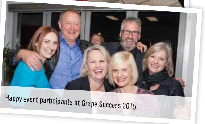
Happy event participants at Grape Success 2015.