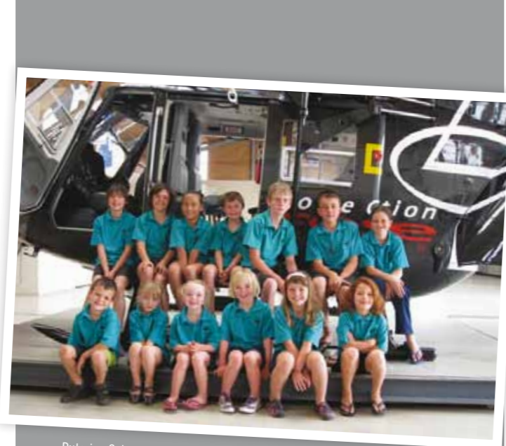
Putorino School pupils with the Helicopter Rescue Trust's BK117 rescue helicopter during a visit to its hanger in Hastings last year.