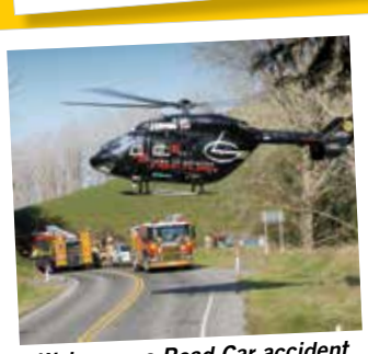
Waimarama Road Car accident Sept 2018