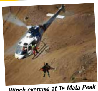
Winch exercise at Te Mata Peak