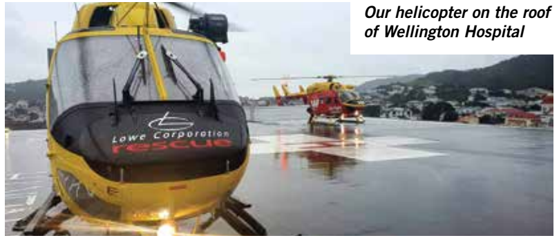
Our helicopter on the roof of Wellington Hospital

Our team were tasked by Air Desk to fly a patient with a cardiac condition to Wellington Hospital for specialist treatment. Then on the way back we were urgently tasked to a patient who had neck injuries from a fall. We landed at the scene where our Intensive Care Paramedic assessed the patient and we flew her directly to Wellington Hospital for further treatment.