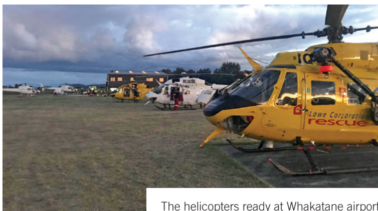
The helicopters ready at Whakatane airport

Monday 9 December 2019 started as any other for the team at our Hastings base. But as can be the case, it turned out to be a day that tested our service to the maximum and has left a lasting impression on everyone involved.