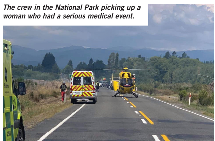
The crew in the National Park picking up a woman who had a serious medical event.