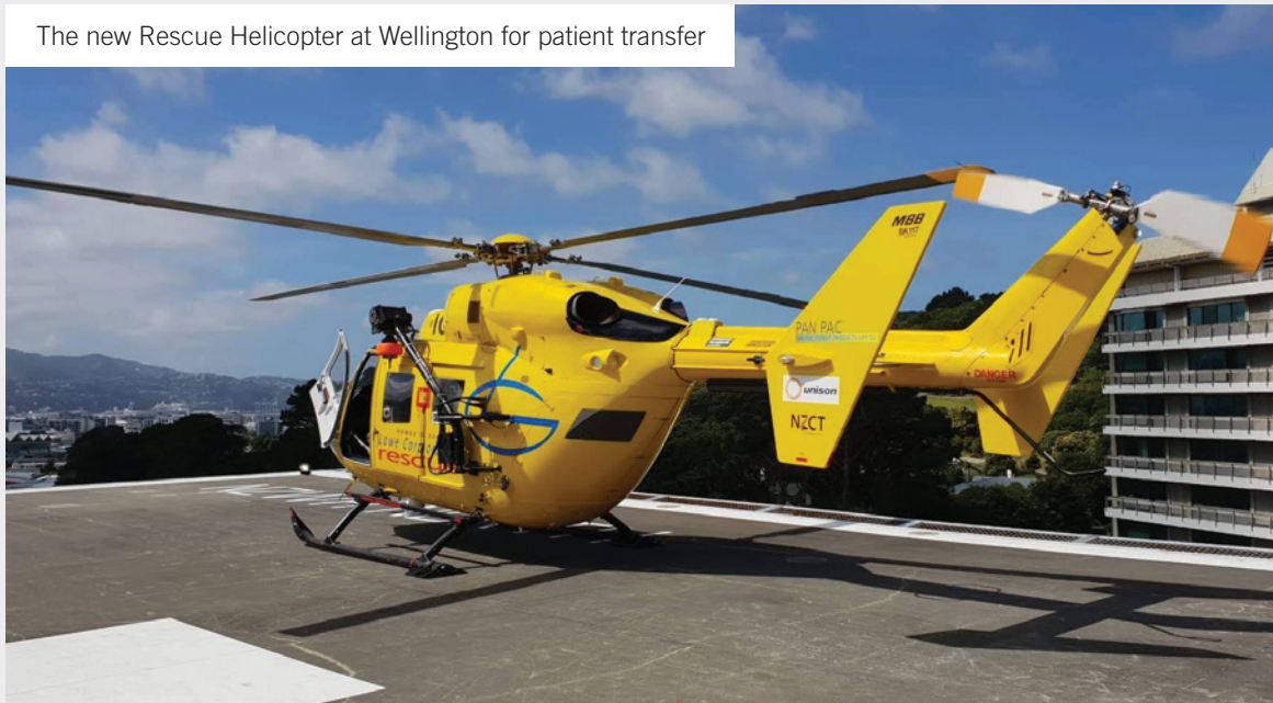
The new Rescue Helicopter at Wellington for patient transfer