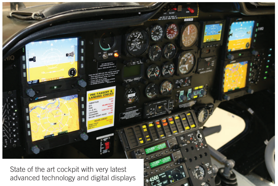
State of the art cockpit with very latest advanced technology and digital displays